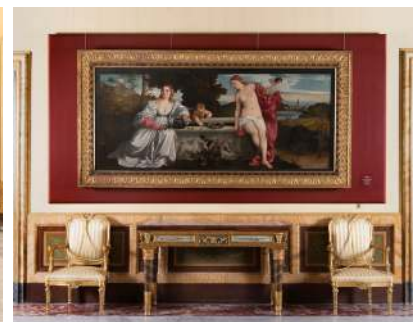
Tiziano Vecellio, Amor Sacro e Amor Profano, 1514-1515. Galleria Borghese, Roma