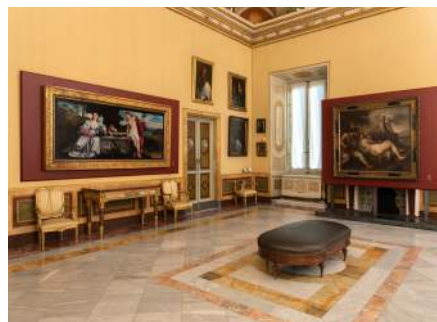
Tiziano, Dialoghi di Natura e di Amore , Installation view.

Love appears in Titian's painting in its different forms: divine, as a nymph, and by a young girl or a bride. In The Three Ages of Man , whose original is in Edinburgh, the narration is built around feelings of love and passion. The artist represents the idea of the life cycle in allegorical terms. Childhood and manhood are synonymous with terrestrial love, and old age close to death are drawn realistically as each figure reflects Titian's attitudes toward each stage of earthly existence in relation to love.